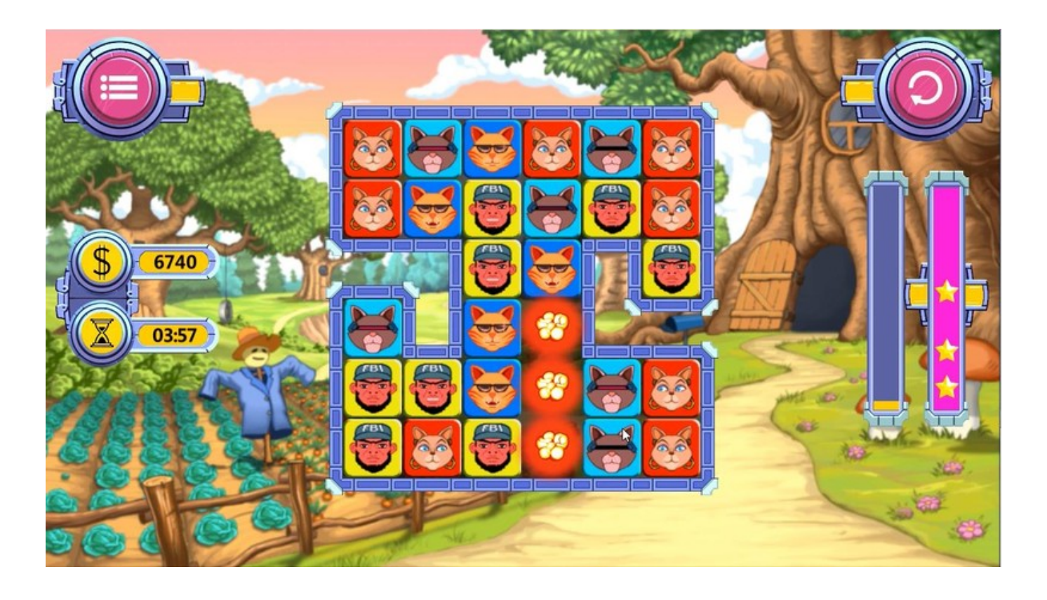
Mad Muzzles Crack By Razor1911 Download

Download >>> <a href="http://bit.ly/2NShRei">http://bit.ly/2NShRei</a>